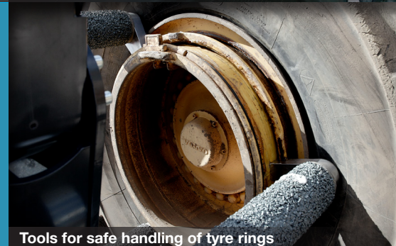
Tools for safe handling of tyre rings