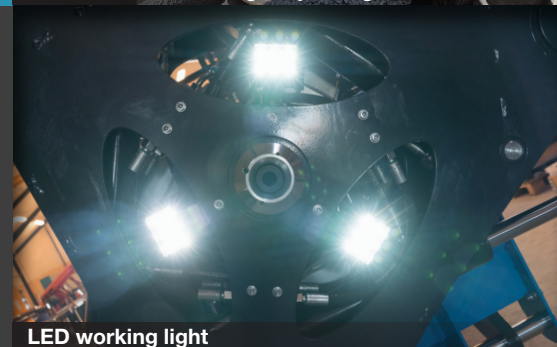
LED working light