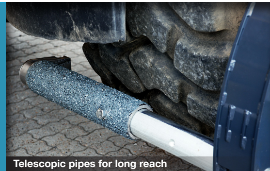
Telescopic pipes for long reach

Can be customized pre-angled depending on carrier.