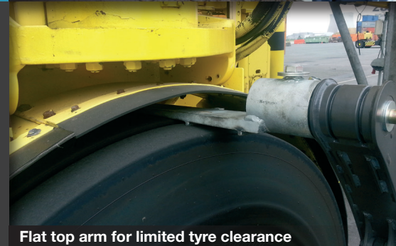
Flat top arm for limited tyre clearance